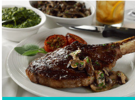
10 Best Steakhouses in Dallas: Texans Have the Beef