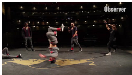
Break Dancing Ballet Tours through Dallas