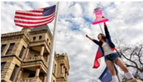
Women's Rally on the Denton Square January 21 at 4:41 p.m.