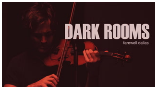
Dark Rooms Say Farewell to Dallas