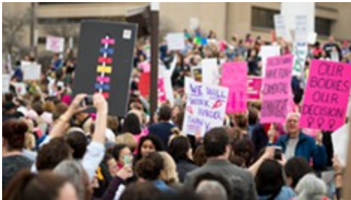
Women March for Justice in Dallas January 21 at 8:38 p.m.