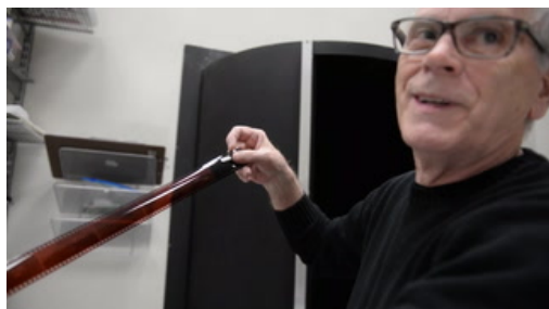
Photographique Has a Deep Love for Analog